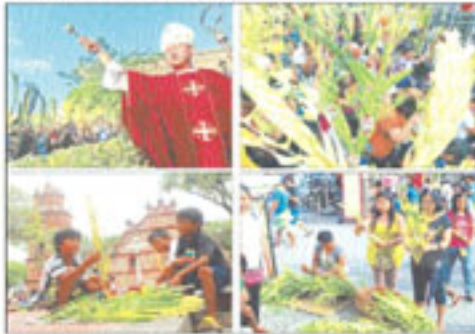
Photo shows (clockwise from top left) Manila Archbishop Luis Antonio Cardinal Tagle blessing the palm fronds before the start of the Palm Sunday mass at the Manila Cathedral in Intramuros, Manila; devotees waving fronds in front of the Tondo Church in Manila; boys playing in front of the St. Dominic Cathedral in Bayombong, Nueva Vizcaya; and women selling palm fronds near the St. Anne National Shrine in Baguio, Bulacan.