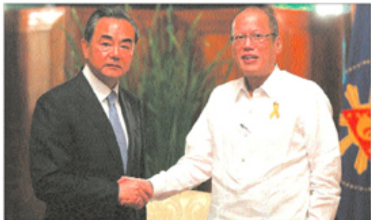
President Benigno Aquino III (right) welcomes Chinese Foreign Minister Wang Yi during a courtesy call in Malacanan on Nov. 18.